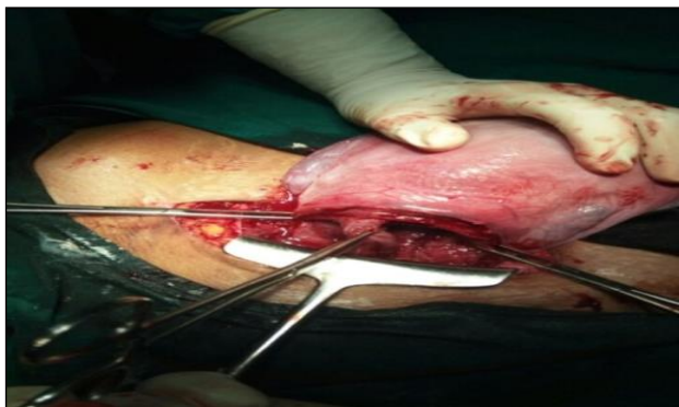
Figure 2: Septate uterus extending from the fundus to internal OS.