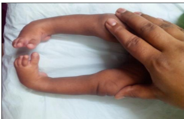
Figure 3: Bilateral CTEV.

Extracted by complete breech a live late preterm female baby of weight 2.28 kgs with bilateral CTEV (Figure 3) of the baby. Per operative findings were-Lower uterine segment was well formed. Septate uterus-extending from the fundus to internal os present (Figure 2), fundal dimpling was present (Figure 1).