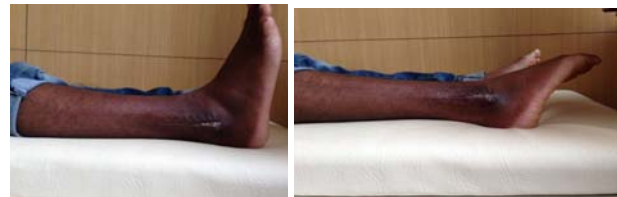
Ankle Dorsiflexion Ankle Plantar Flexion