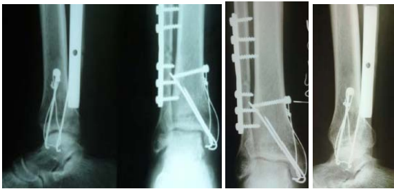
Union at 10 WKS 6 months follow up