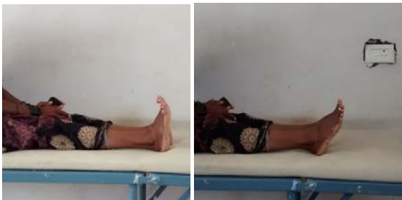
Dorsiflexion of ankle plantar flexion of ankle