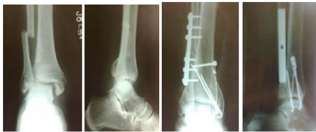
Pre op post op