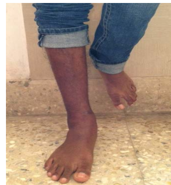
Standing on one Leg