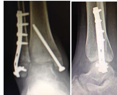
Pre op post op union at 10 WKS