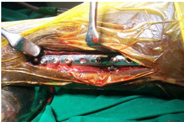
One third tubular plate for lateral malleolus Post – Operative Protocol

Non-weight bearing gait was started from first or the second postoperative day. Partial weight bearing was started after the removal of the cast (after clinical and radiological signs of union become evident). Active exercises of the ankle was advised. In patients with syndesmotic screw fixation, weight bearing was delayed till screw removal. Follow up of cases was done at regular intervals of 6 weeks for minimum of 6 months. Using Biard and Jackson's [5] ankle scoring system.