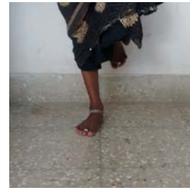
Standing on one leg