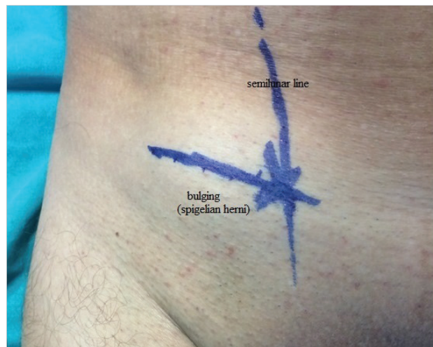
Figure 2. A bulging can be seen next to the rectus muscle. It appears especially during coughing and standing