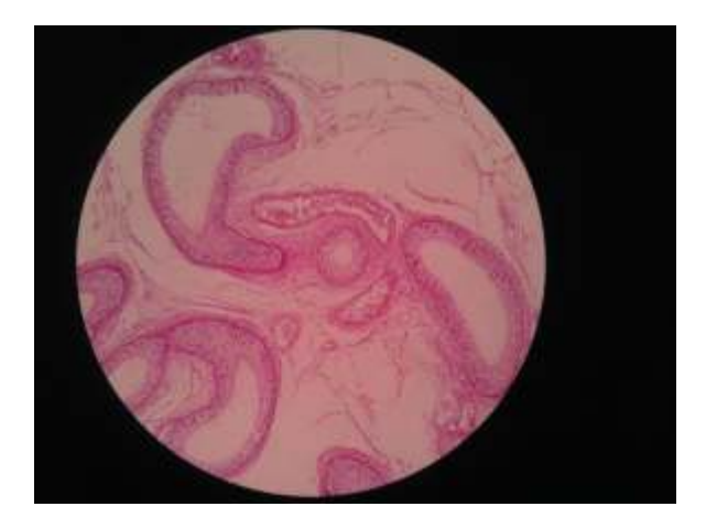
Fig.10 Section Shows Normal Histology of Vas Deferens