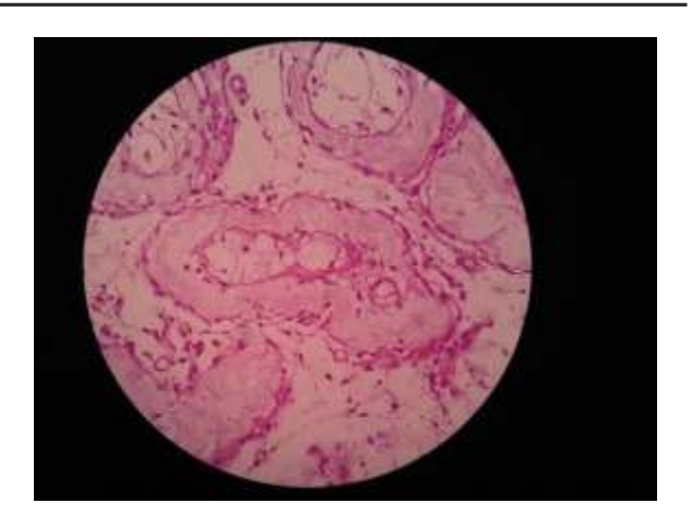
Fig 9: Section of the Smaller Testis Shows Tubules Showing Only Serotoli Cells with Few Hyalinized, Seminiferous