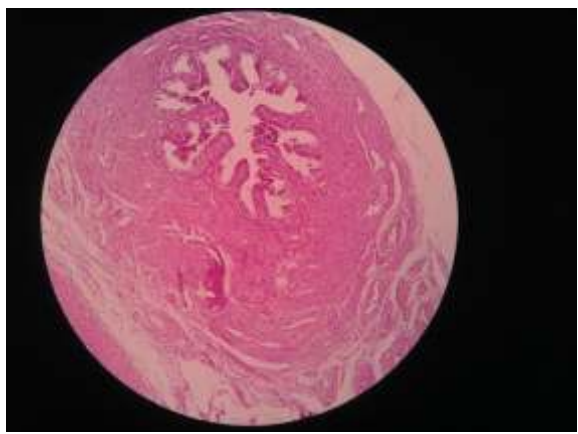
Fig.7: Section shows Normal Histology of Fallopian Tubes