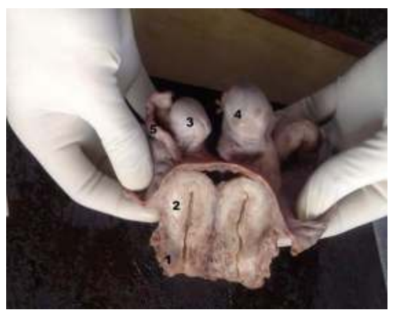
Fig.4. Gross Section Consists of the Uterus and Cervix with Two Testes