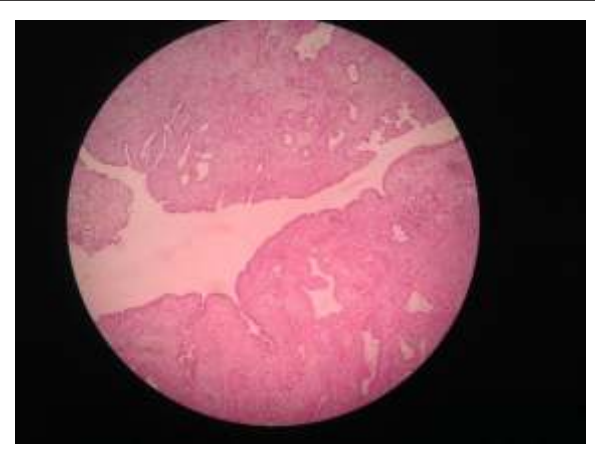
Fig. 6: Cervix shows Normal Endocervix Histology No Ectocervix